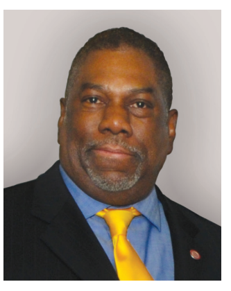
President and CEO